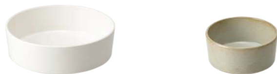
OM-54/OM-64 bowl L gray/white Φ187×55(mm) 700ml OM-55/OM-65 bowl S gray/white Φ123×55(mm) 300ml