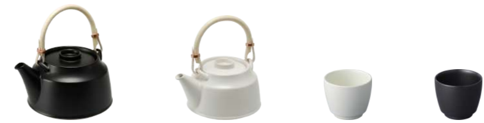
TK-1 TK dobin L white/black 200×173×106(mm) 1200ml TK-2 TK dobin S white/black 165×135×90(mm) 600ml TK-3 TK cup white/black φ82×67(mm) 180ml