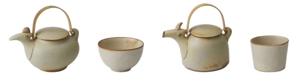
TR-1 POT "TORI" 185×108×160(mm) 480ml TR-2 CUP "TORI" φ90×52(mm) 110ml