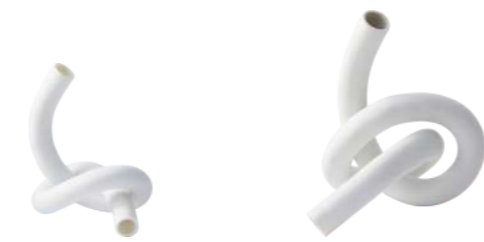
MU-1 MUSUBU Small 105×70×115(mm) MU-2 MUSUBU Large 160×120×150(mm)