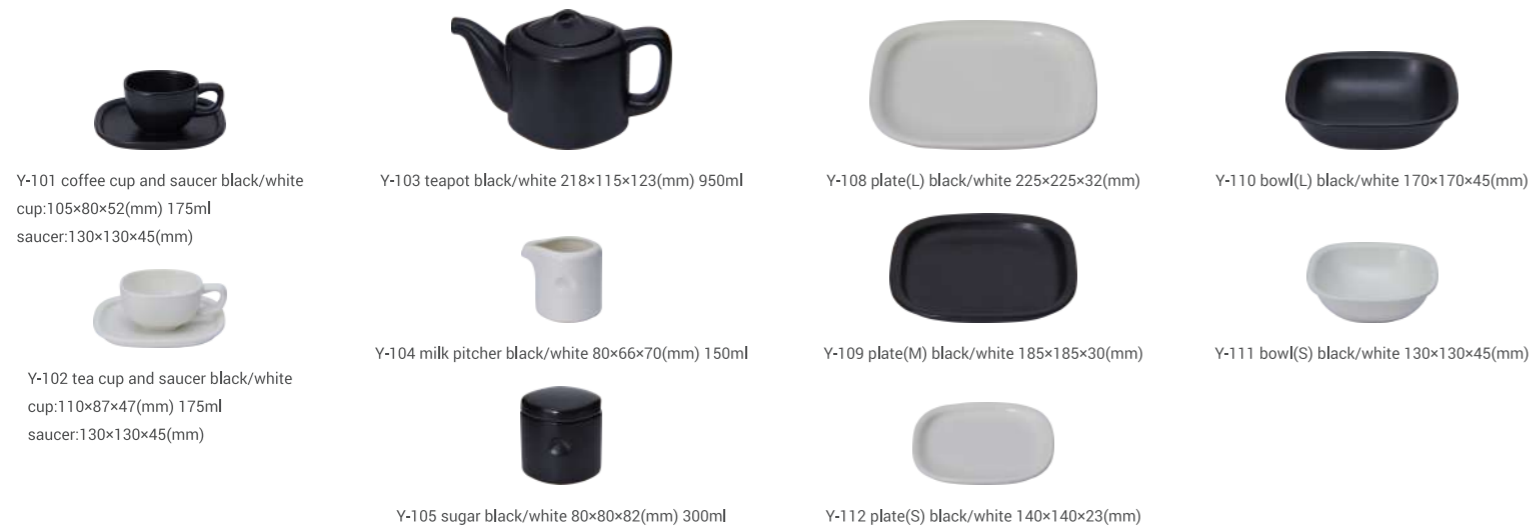
Y-101 coffee cup and saucer black/white cup:105×80×52(mm) 175ml saucer:130×130×45(mm)

At the time of release of this series, mass-produced ceramic tableware was mainly produced using Automatic Roller Jiggering Machine. We adopted casting molding (pressure casting, slip casting) to avoid overproduction, and were able to achieve a square design instead of a rotating body. White and black matte glaze was used to match the soft shape. In 2023, production and sales of the series have been started as an original product of Ceramic Japan.