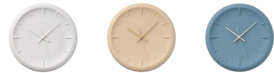
RF22-06 RELIEF white/beige/blue φ274×40(mm)