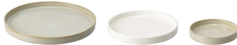
OM-51/OM-61 plate L gray/white Φ255×25(mm) OM-52/OM-62 plate M gray/white Φ195×25(mm) OM-53/OM-63 plate S gray/white Φ135×23(mm)