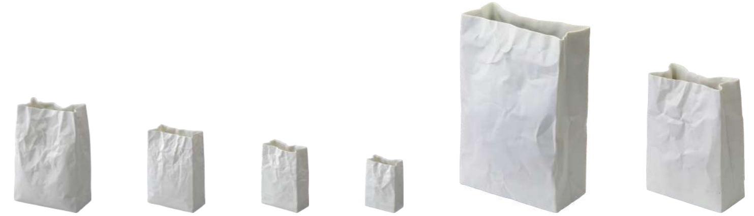
NSB-1 new crinkle super bag #1 white/gray 140×80×195(mm) NSB-2 new crinkle super bag #2 white/gray 100×60×145(mm) NSB-3 new crinkle super bag #3 white/gray 90×50×130(mm) NSB-4 new crinkle super bag #4 white/gray 60×35×90(mm)