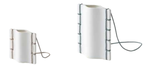
WF-1 WATOJI(S) beige/mint 100×35×96(mm) WF-2 WATOJI(L) beige/mint 126×46×16(mm)