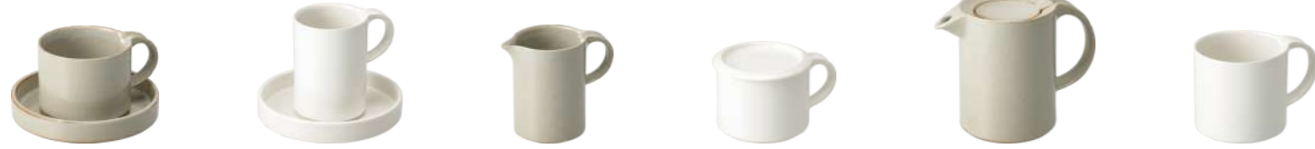
OM-1/OM-31 cup and saucer gray/white cup: 110×80×65(mm) 200ml saucer: Φ135×23(mm)