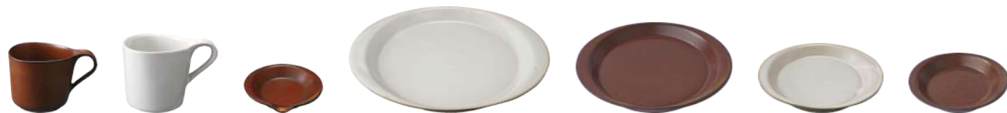
OD-1 cup white/brown 110×80×70(mm) 180ml OD-7 mug white/brown 118×85×83(mm) 250ml OD-2 spoon rest white/brown 85×98×20(mm)